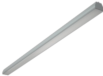
LINER/S CC LED

Transport hubs (railway stations, airports)